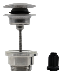
Pop-up valve Push Open