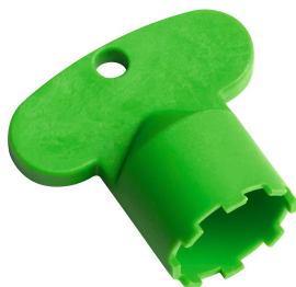
Service key Neoperl © Caché ©, TJ, 18 mm, green