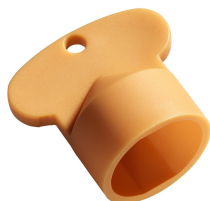
Cartridge S 25